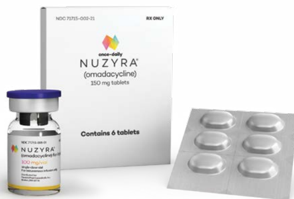
Vial and product packaging are not shown at actual size.

Please see Indications, Usage, and Important Safety Information on page 2 and full Prescribing Information in pocket.